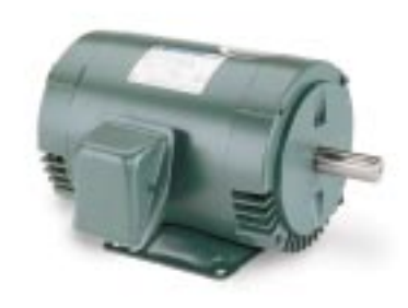
General Purpose Dripproof Meets EPAct and Canadian NRCAN