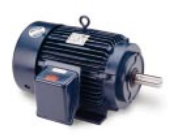
Blue Chip® Totally Enclosed Meets EPAct and Canadian NRCAN